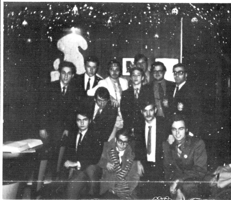
Delta Chapter at their recent Induction Dinner.

Delta, the oldest active chapter in Alpha Phi Delta, will be celebrating its fiftieth year on the campus of the Polytechnic Institute of Brooklyn by honoring alumni of the chapter with a dinner — dance, to be held on Friday, May 8, 1970 at the Victorian House, 67 — 16 Myrtle Avenue, Glendale, N.Y.