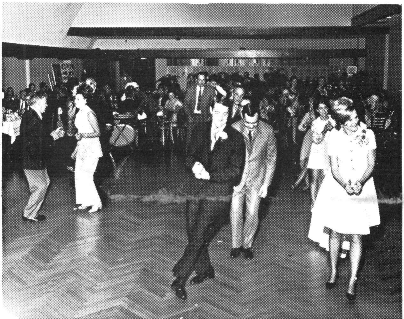
Small portion of crowd that gathered at Churchill Country Club for Annual Dinner Dance, Social Highlight of Pittsburgh area affairs. October 25, 1969.

Dancing followed until the wee hours of the morning.